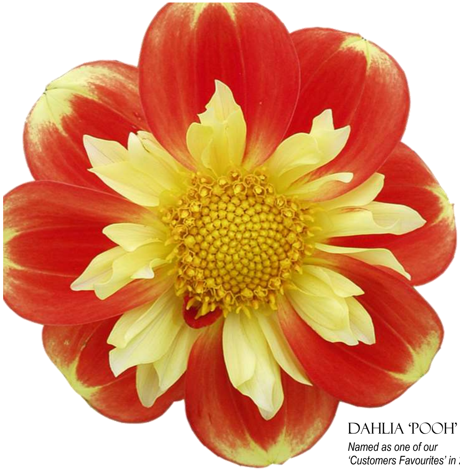
DAHLIA 'POOH' Named as one of our 'Customers Favourites' in 2017